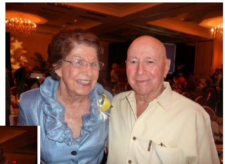
Shining Star Luncheon Friday, October 22, 2010