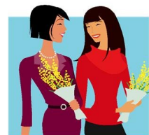
AAUW: Breaking through barriers for women and girls