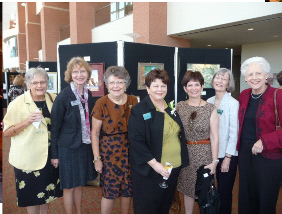
Celebrating with Friends