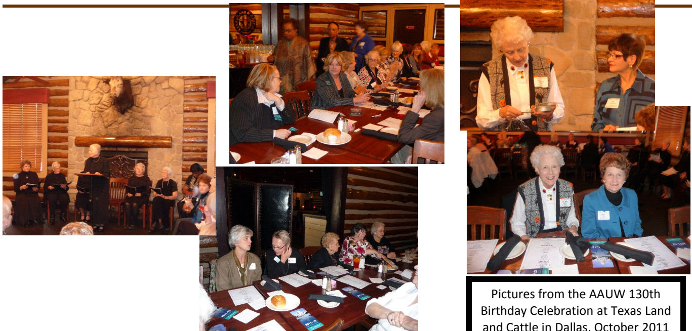
Pictures from the AAUW 130th Birthday Celebration at Texas Land and Cattle in Dallas, October 2011