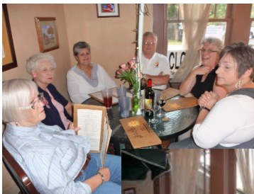
Friends, food and fun at Mi Tierra