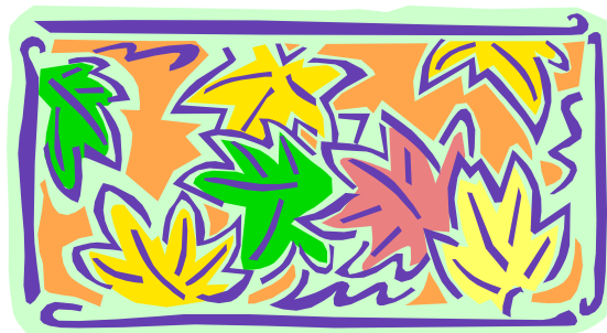
AAUW: Breaching through barriers for women and girls

We had a wonderful New Member Brunch and had the opportunity to showcase a new year for Northeast Tarrant Branch! Everyone has been working hard and our calendar is full of branch meetings and events