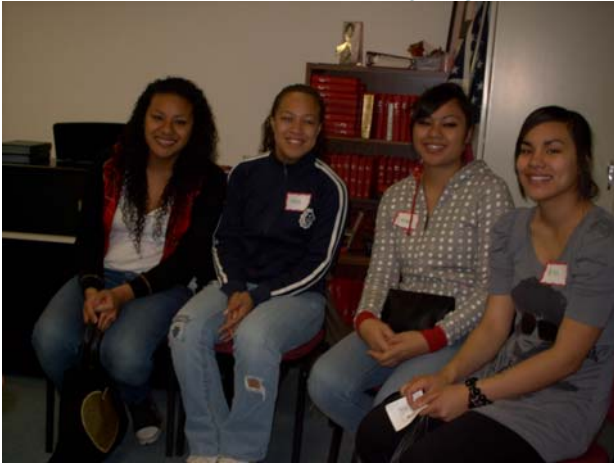
Members of the GAP club from Trinity High School. These young women spoke at our January meeting.