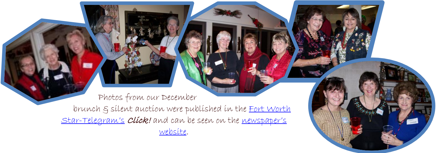
Photos from our December brunch & silent auction were published in the Fort Worth Star-Telegram's Click! and can be seen on the newspaper's website .